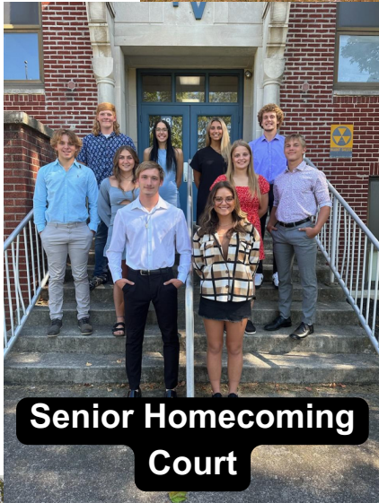
Senior Homecoming Court