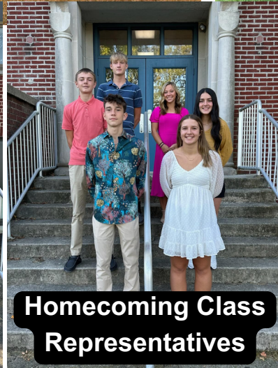
Homecoming Class Representatives